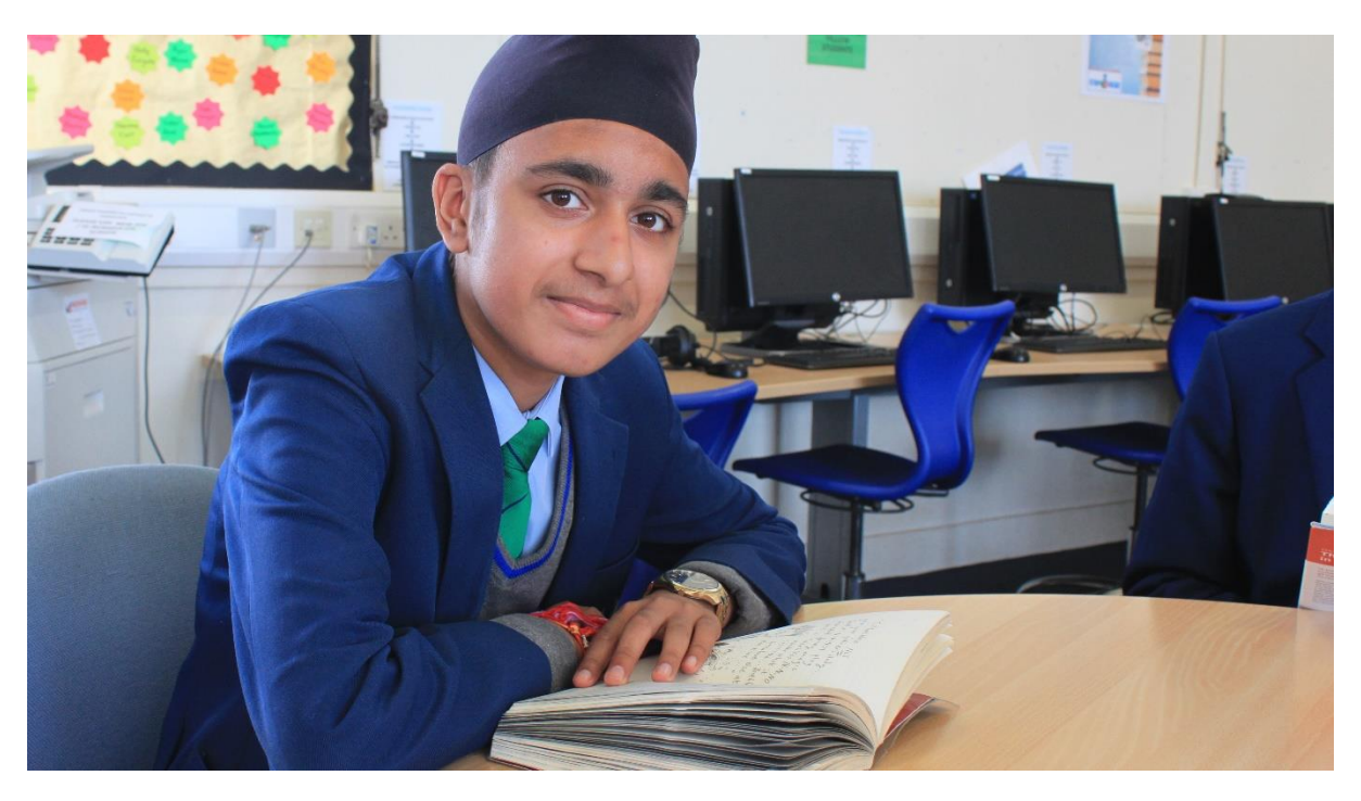
"Being a role model is the most powerful form of educating. Youngsters need good models more than they need critics" - John Wooden

'The Westbourne Way' guidance for staff outlines the ways in which we put our values into practice, with the aim to engender and foster exemplary behaviours, which enable our staff to be the very best role models for our learners.